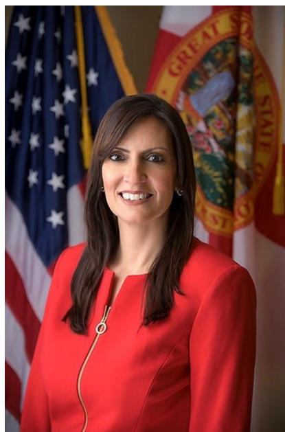
Mrs. Jeanette M. Nuñez, Interim President of FIU