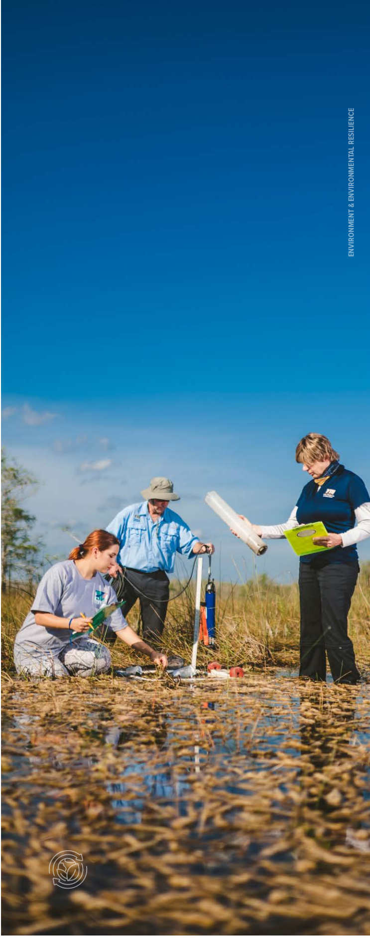
ENVIRONMENT & ENVIRONMENTAL RESILIENCE