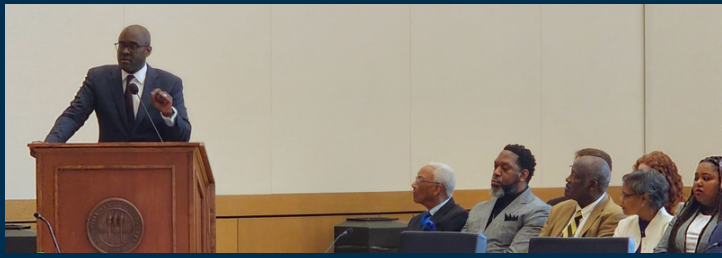
Board of Governors Meeting, Florida State University