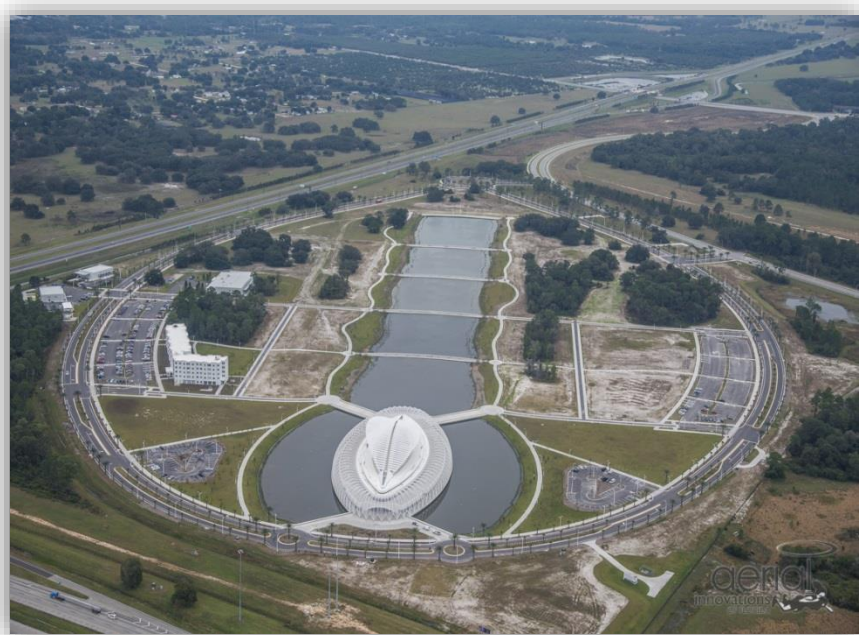
Florida Polytechnic University Campus View

The University received in March 2015 approval from the Board of Governors for a 529 bed housing project to be developed on campus using a Public-Private Partnership. This second residence hall project is also being developed by Vestcor, the winner of the public solicitation process. Construction begins in June of 2015 and the facility is scheduled to be open for the Fall of 2016 term.